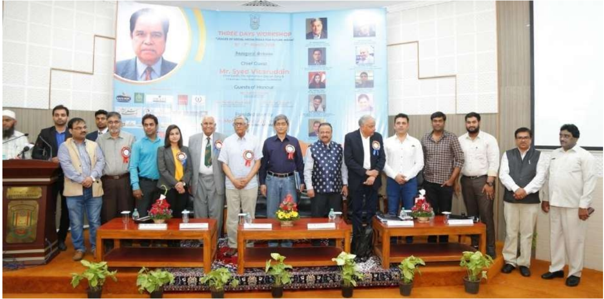
A Group Photo of all the dignitaries on occasion of Inaugural Session of Three Days Workshop held on 5th March 2019.