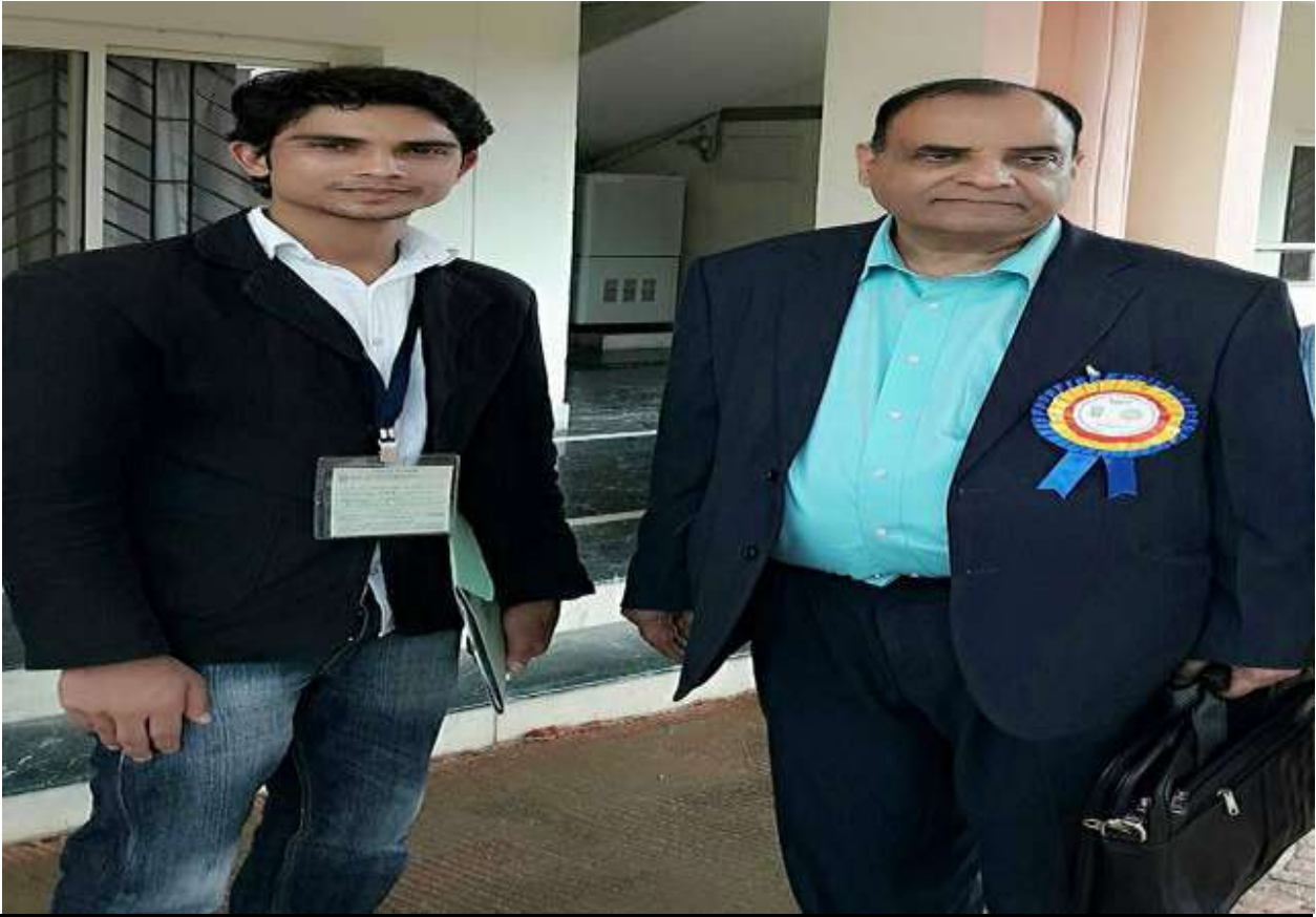
A Student of M. A. (JMC) with Padma Shri Alok Mehta, Chief Editor, Outlook, New Delhi during 5 Days Workshop at Hyderabad