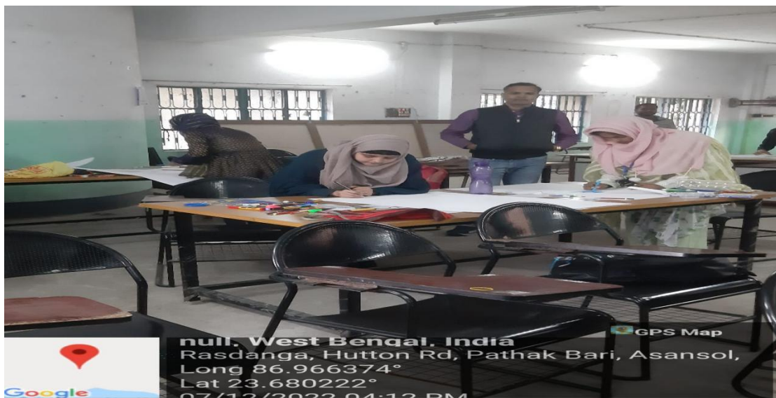
Poster presentation in progress at CTE, Asansol

Nearly three hundred students participated in various events across different campuses.