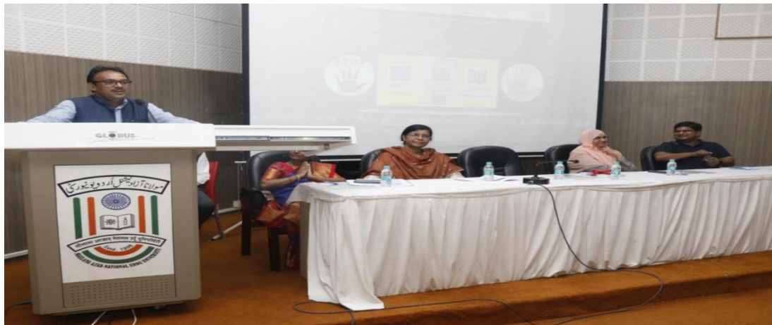
Registrar addressing the gathering at the Inaugural Session (25 -11-2022)