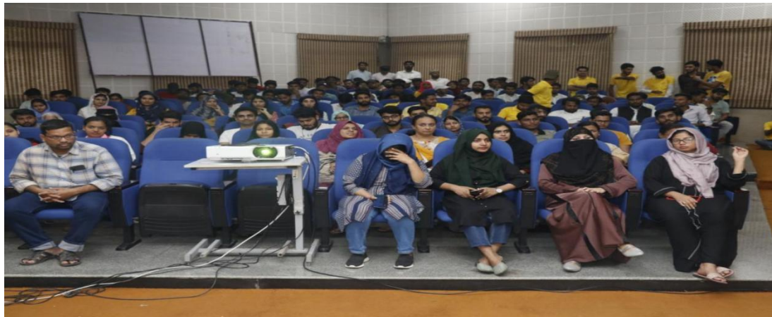
A section of the audience on 25-11-2022