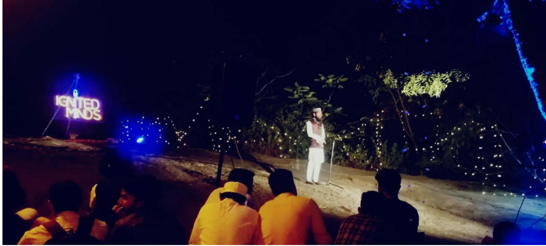
A contestant in the Open Mic event (5-12-2022)

The University Drama Club has themed its monthly Open Mic Ignited Minds on Violence against Women. Twelve students participated on the theme and performed monoacting, poetry, elocution and mimicry.