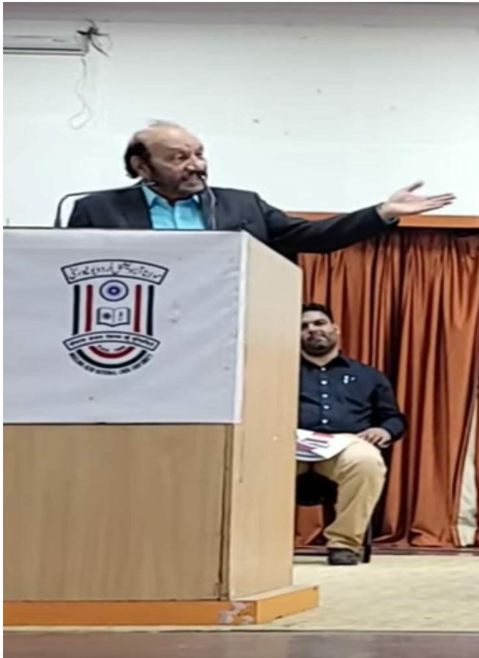
Vice Chancellor delivering the Presidential Address (9-12-2022)