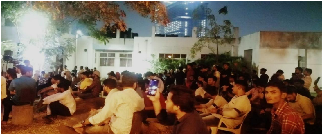
A section of the audience during Open Mic (5-12-2022)