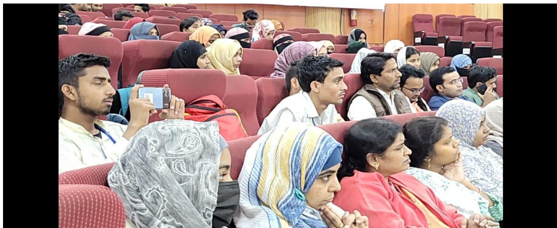
A section of the audience (9-12-2022)